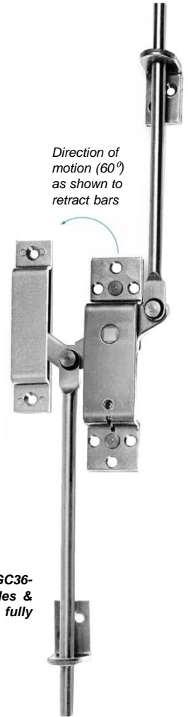
Direction of motion (60°) as shown to retract bars